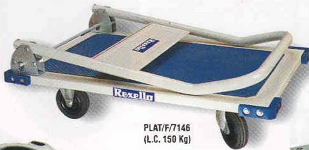
PLAT/F/7146 (L.C. 150 Kg)