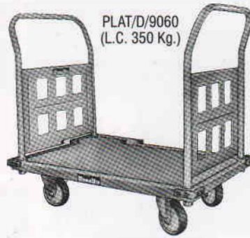
PLAT/D/9060 (L.C. 350 Kg.)