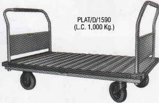
PLAT/D/1590 (L.C. 1,000 Kg.)