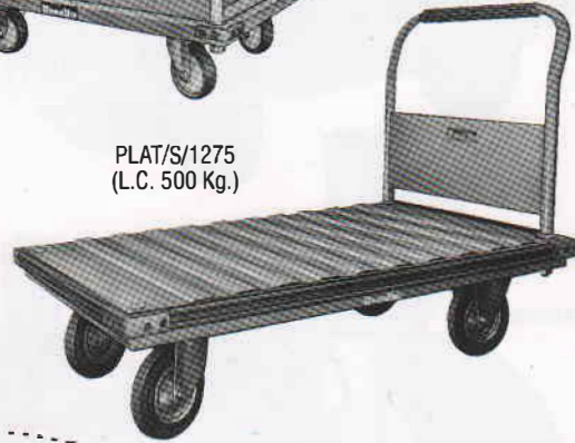
PLAT/S/1275 (L.C. 500 Kg.)