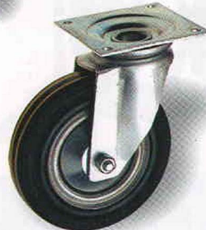
Medium Industrial Use RG/PT/CT/160/R/TG

Castors & Wheels from 25 mm to 500 mm with L.C. upto 5000 Kgs. Each & Standard Platform Trucks for material handling.