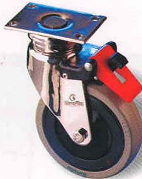
Institutional/Hospital Use DXM/PT/GCN/125/FNBK