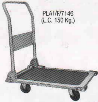
PLAT/F/7146 (L.C. 150 Kg.)