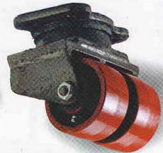
Extra Heavy Duty HSC2/PT/C/100/R/TW